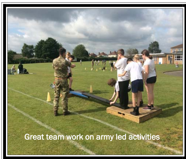
Great team work on army led activities