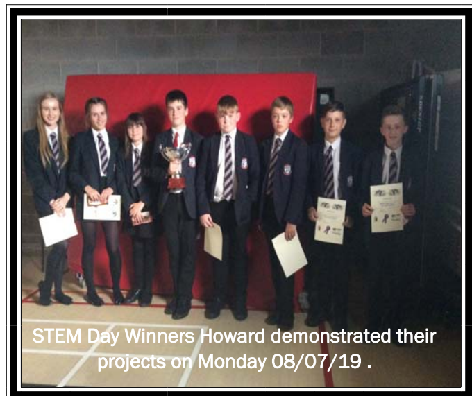
STEM Day Winners Howard demonstrated their projects on Monday 08/07/19 .