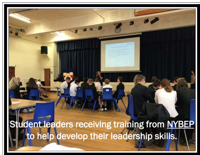
Student leaders receiving training from NYBEP to help develop their leadership skills.

I really enjoyed film studies because you got to learn about different ways of filming and directing movies. We also got to talk about our favourite films and watch thrilling trailers.